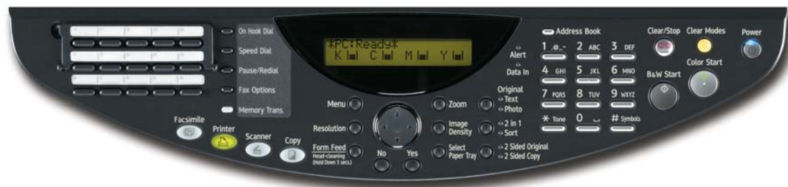
Set up print, copy, scan and fax* jobs in seconds with the intuitive control panel.

The speed of laser. The convenience of inkjet. All-in-one capabilities. And the vivid business color of GelSprinter™ technology. Now you can have it all with the SAVIN® GX3000s/GX3000sF/GX3050sFN desktop color MFPs. These three incredibly cost-effective systems bring all the advantages of full-color performance to small offices and workgroups — in a flexible design that boosts your personal productivity.