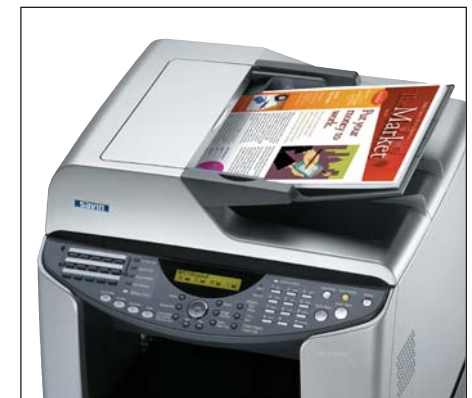
Handle any task — including full-color scanning and faxing* — with a single system.